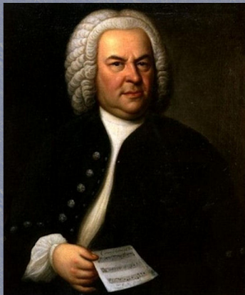
Johann Sebastian Bach